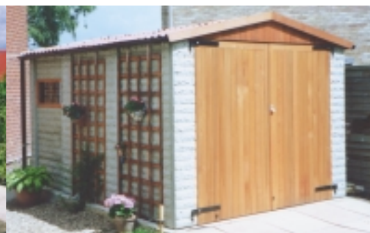
9' wide Apex Rockstone with optional side hung cedar doors, cedar fascias and guttering.