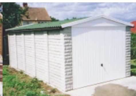
Apex Rockstone 10' wide with optional plastisol coated door, PVCu fascias, olive green coloured roof sheets and guttering.