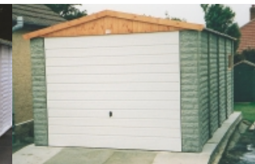
10' wide Apex Rockstone standard.