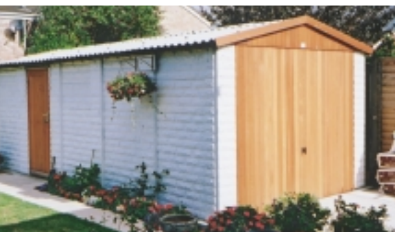
10' wide Apex Rockstone with optional cedar door, fascias, personnel door and guttering.

"Compton agents were rated highly in all categories tested" Source: Consumer Research 2001