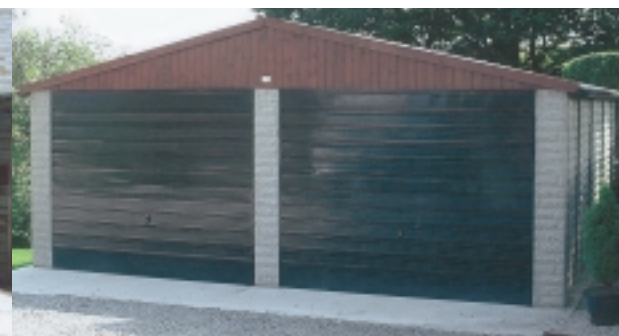
19' wide Apex Rockstone with galvanised steel doors (painted by customer), optional cedarwood fascias and guttering.