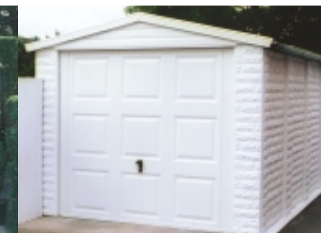
Apex Rockstone 9' wide with optional Georgian plastisol door, PVCu fascias and guttering.