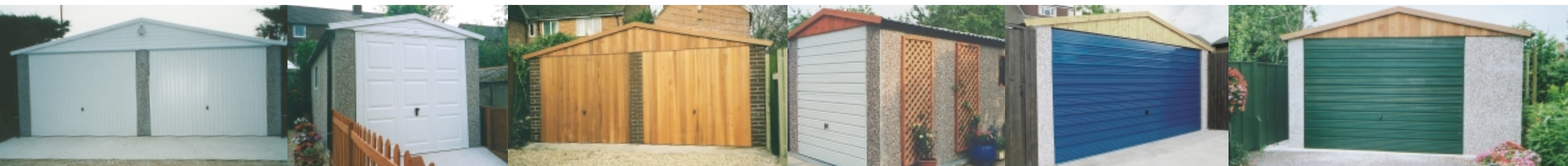
19' wide Apex Spar with optional plastisol steel up and over doors and maintenance free PVCu fascias.

“90% of customers would recommend their local agent to family and friends” Source: Consumer Research 2001