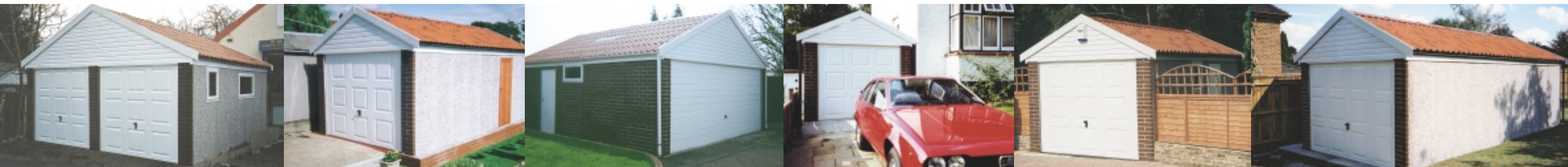
Banbury Spar 17' wide with plastisol coated Georgian doors, PVCu opening window and optional 4' wide double glazed PVCu window.

"92% of customers say their building has made their property more desirable" Source: Consumer Research 2001