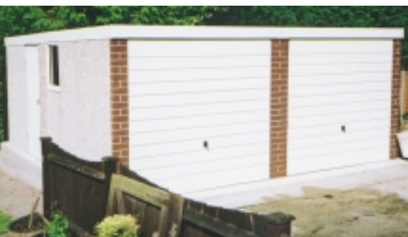
Flat Spar twin 18'9" wide with galvanised steel up and over doors, optional brick front posts, plastisol coated personnel door and fascias and PVCu fixed window.

"70% of customers rated their satisfaction with Compton as excellent or very happy" Source: Consumer Research 2001