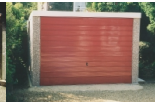
Flat Spar 10'6" wide with galvanised steel up and over door (painted by customer) with optional white plastisol coated steel fascia.