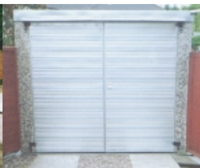
Newbury with galvanised steel side hung doors, steel fascias and verge boards.