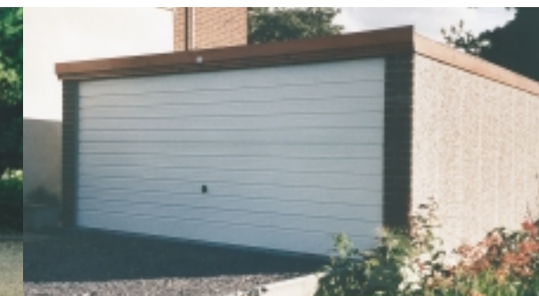
Double Flat Spar 17' wide with optional 15'2" wide door, timber fascias and optional brick front posts.