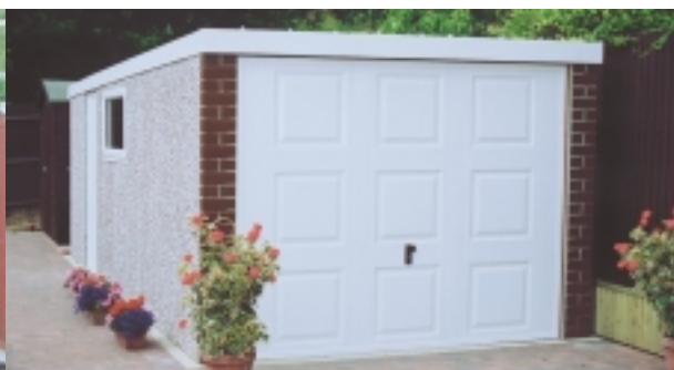
9'6" wide Flat Spar with optional Georgian style plastisol door, brick finish front posts, plastisol fascia, PVCu double glazed window and plastisol personnel door.