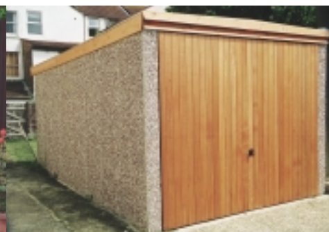
9' wide Flat Spar with timber fascias, optional cedarwood door and guttering to rear.